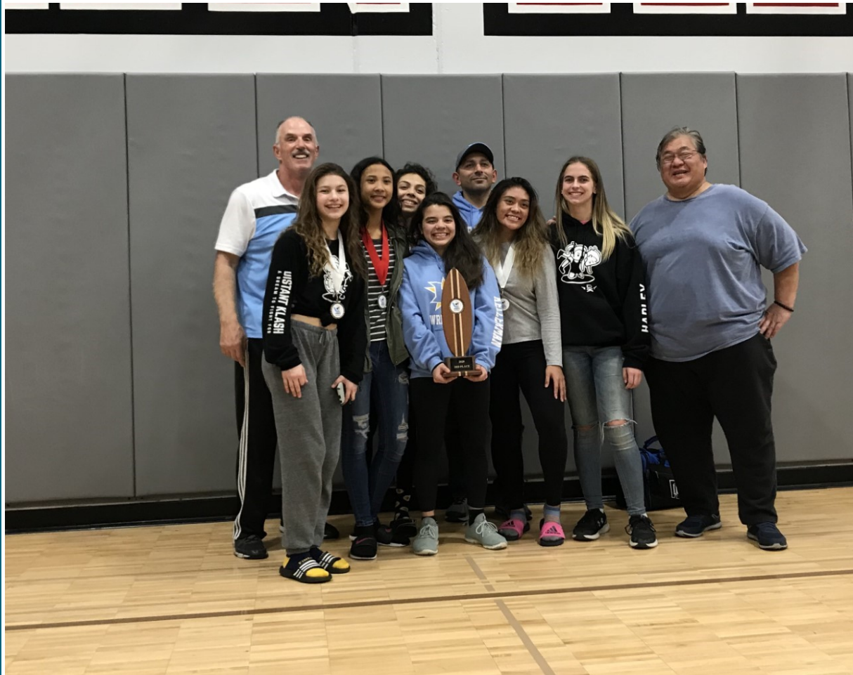
The Heritage girls wrestling team placed 3rd out of 40 schools in Santa Cruz

Looking to contact a coach? Here is a direct link to our athletic staff directory: https://ca01001129.schoolwires.net/Page/15412