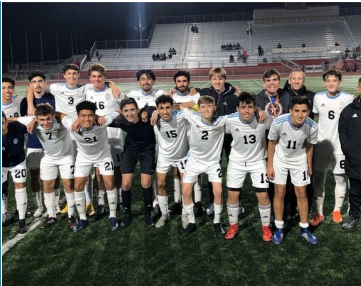
The boys soccer team beat Liberty for the second time on Thursday night

They finish their season with a pair of home games next week, hosting Pittsburg on Tuesday and Deer Valley on Thursday.