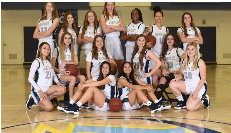
Our varsity girls basketball team has won 42 straight games in BVAL play

The team maintains a 3.64 team GPA, and has given back to the community in numerous ways, including raising over $2300 for our Unified Sports program and putting on a combined farewell dinner for our guests from Kamehameha-Honolulu at the completion of the West Coast Jamboree in December. Congratulations to these great role models in our athletic department!