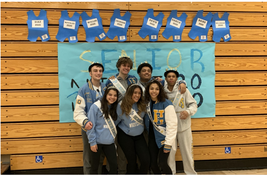
The seniors on the wrestling team enjoyed a Senior Night win over Deer Valley